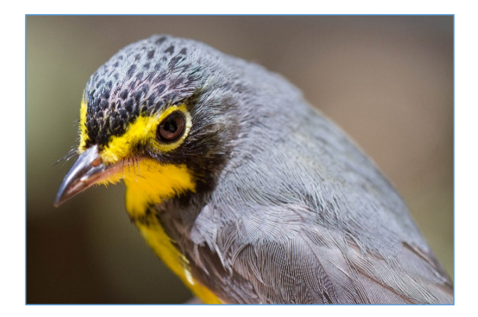
Species A - Canada Warbler